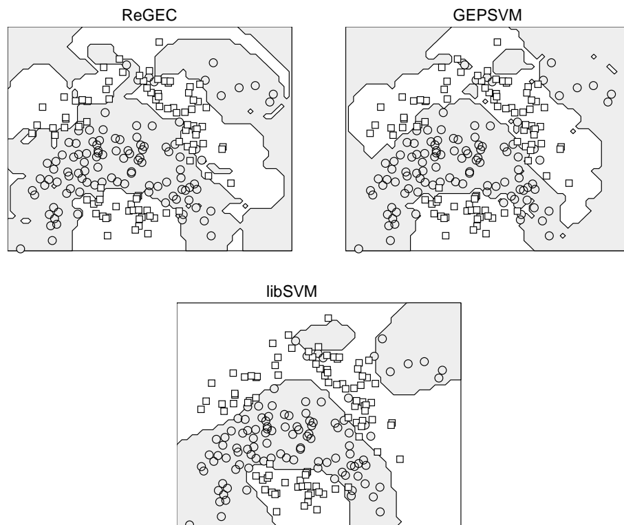
Figure 2: Separation surfaces obtained with ReGEC, GEPSVM and LIBSVM on Banana dataset

attractive for the classification of very large sparse data sets.